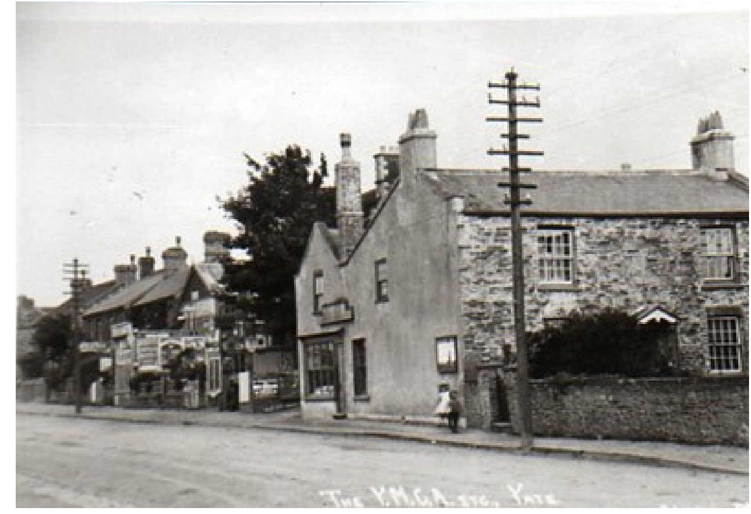
No.24 to 28 in the background 1914 (YHC)